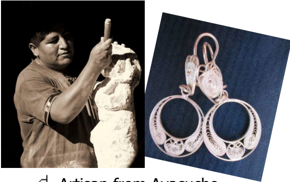
d. Artisan from Ayacucho